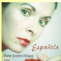
ESPAÑOLA - Enrique Granados & Isaac Albéniz