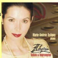
Valses & Impromptus Frédéric Chopin