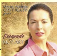
Escapade - W.A. Mozart