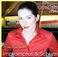
Impromptus & Scherzi Franz Schubert